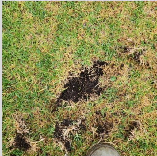
Levelling and reurfing path ends. Insect activity has increased with pests observed on fairways and greens.