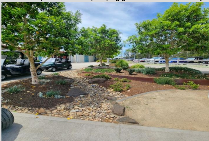
the clubhouse. Already he has had a very positive impact.